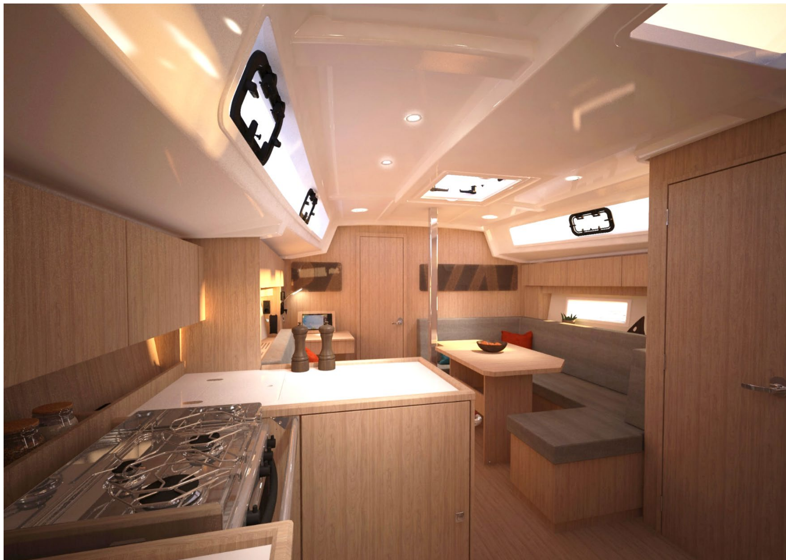
C38 - Pantry