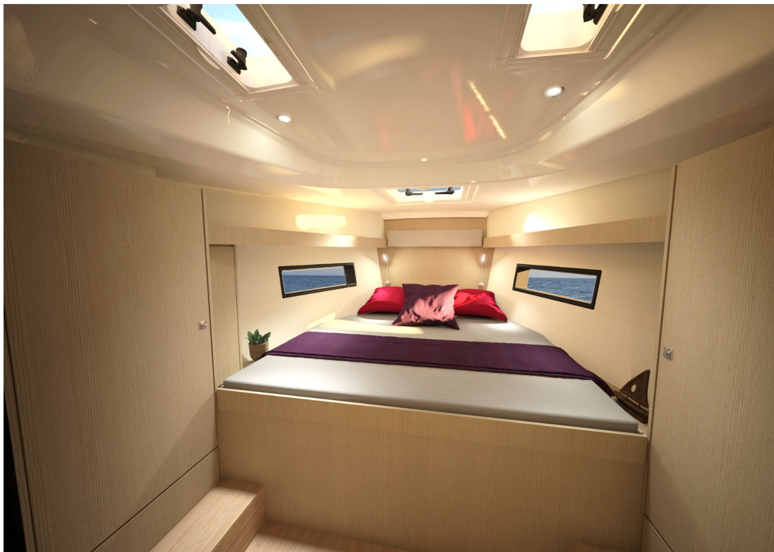
C38 - Owner cabin