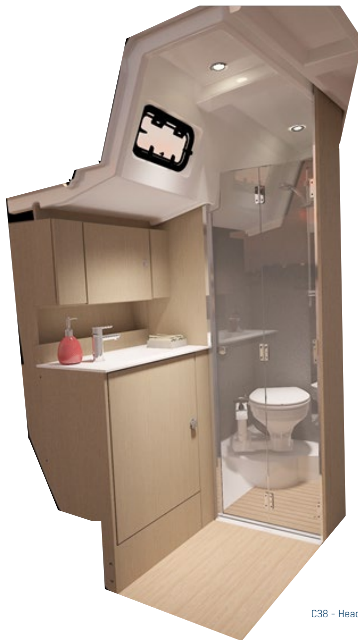
C38 - Head