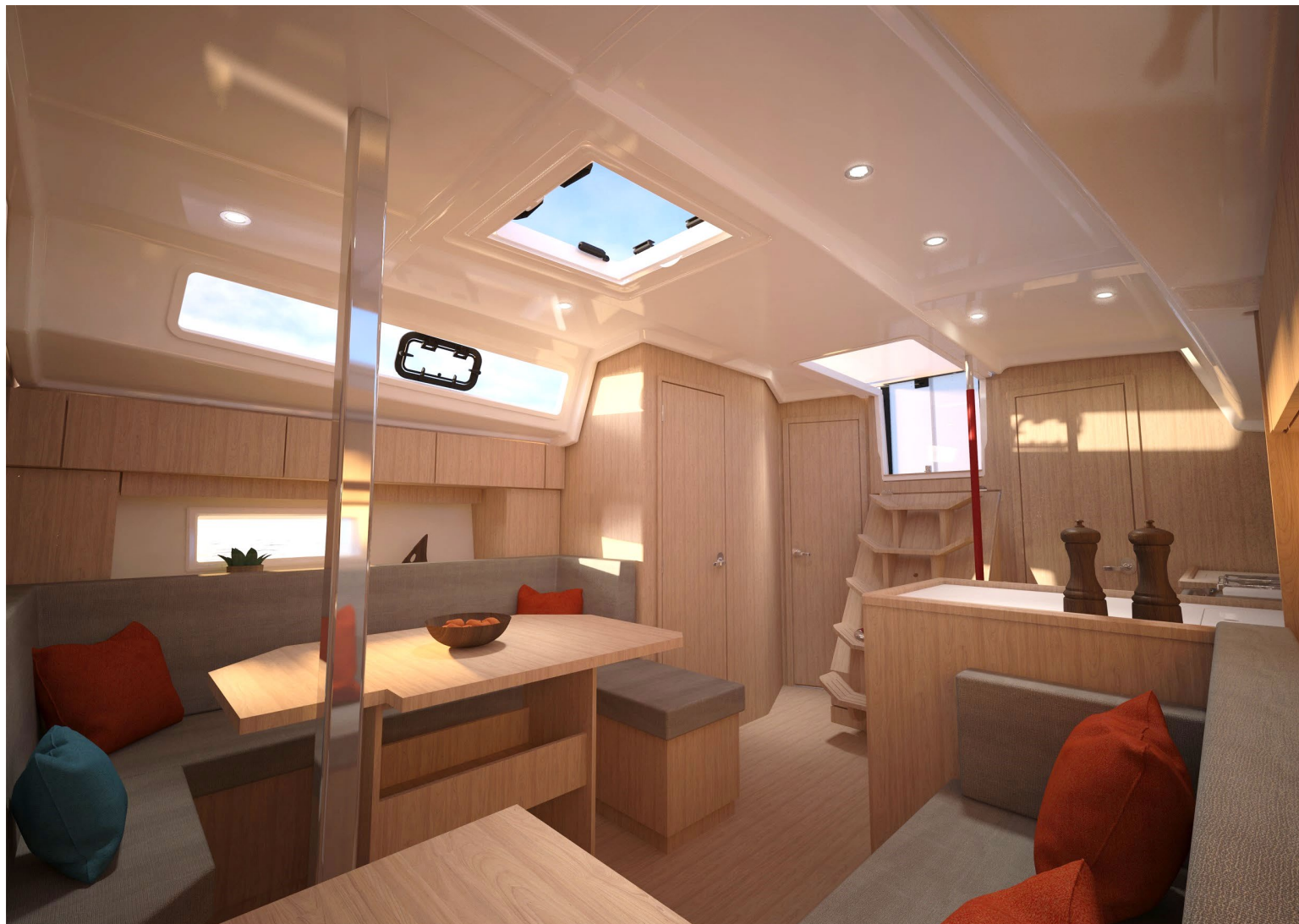
C38 - Salon